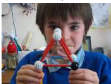
Investigating bubbles during a science workshop

There are currently 78 children on roll. The children are organised into four small classes, Foundation Stage, Key Stage 1, Years 3/4 and Years 5/6. A variety of teaching methods are employed involving whole class work, group sessions and individual activities. Children who need extra help are identified and provided with individual programmes of work. More able children are challenged and encouraged to develop their strengths. Teaching assistants support the work of every class.