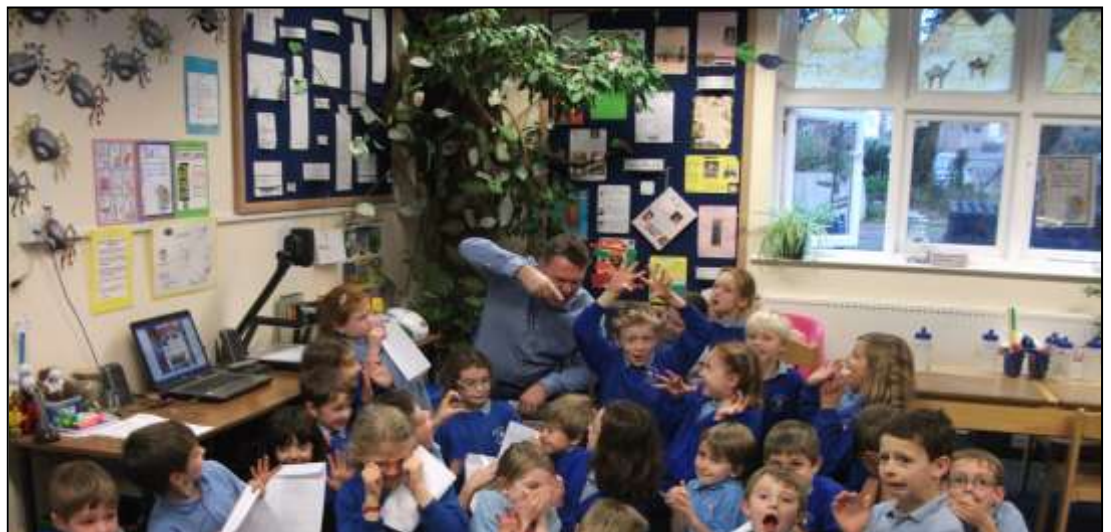
Workshop with a visiting poet

At Key Stage 2 the children continue to read and practice tables and spellings. They have weekly English and Maths tasks and sometimes research activities.