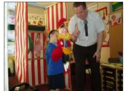
Learning about the seaside long ago