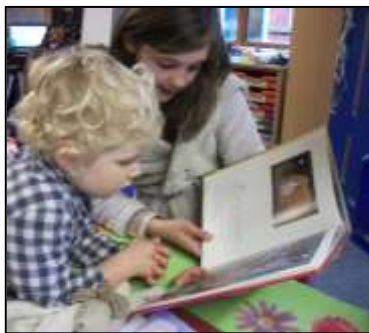
Classes reading together during Bedtime Story Day