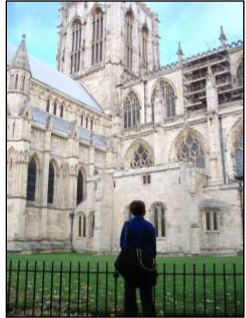
Visiting York Minster

Children are introduced to a wide variety of historical sources enabling them to form an awareness of the past and a sense of "long ago". These include studies in the local area, the use of primary and secondary sources and personal memoirs. This helps to form a sense of chronological order and learning about change over time. In Key Stage Two children learn about British history and ancient civilisations as well as important local historical events. Research skills are developed and first hand investigation is encouraged. We aim to make the past "come alive" for the children and enhance their learning by visiting places of historical interest.