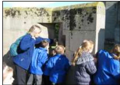
A visit to Warwick