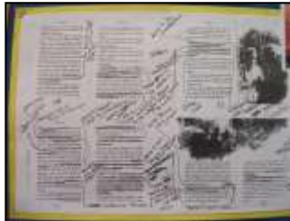
Analysing fiction in Year 5/6

A daily English lesson is taught and children work on units of work relating to a variety of narrative, non-fiction and poetry texts. There is a daily spelling programme and children regularly read to an adult on an individual basis. A high emphasis is placed on developing phonic skills. We have a vibrant library and the mobile library visits the school every fortnight.