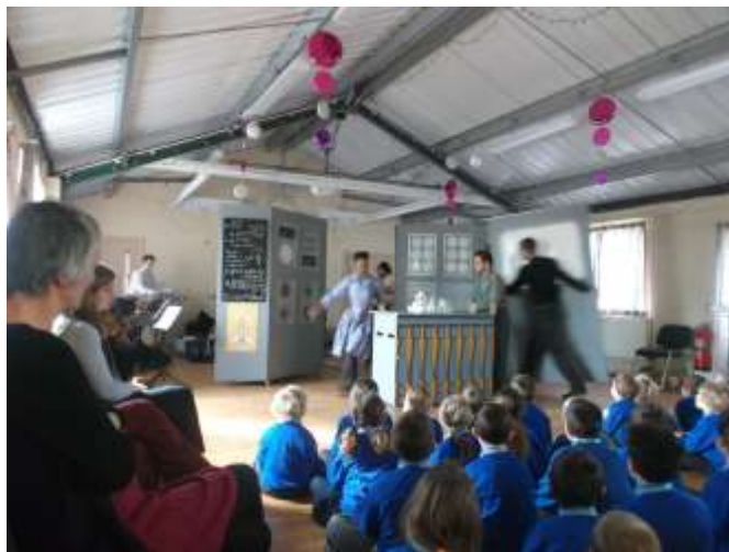
A visit by the English Touring Opera

Kindness, love and respect for one another are fostered with the help of teaching and non-teaching staff. Work in the local community and fund-raising for charity makes the children aware of the needs of others.