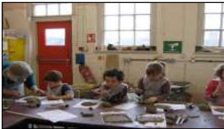
A visit to an artist's studio to make clay

During the school year a number of educational visits are made to places of interest and children are taken to the theatre at Christmas. Additionally we make use of our local environment. We regard Educational Visits as an important part of the learning process. We send details of such visits with a reply slip for your permission. There are however, occasions when a spontaneous visit may occur e.g. a walk around the village. We therefore ask for blanket permission for such an occurrence. Detailed risk assessments are carried out for all local and residential trips.