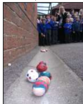
Traditional egg rolling at Easter