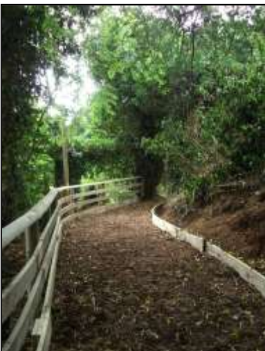
Our woodland trail

Children build on their own experience of the way people live and their knowledge of places and environment. They develop an understanding of maps and places locally and further afield. They collect, interpret and study data concerned with physical, human and environmental geography. Interactive media, pictures, artefacts and books are used in their studies, which include the weather, climate, places, populations, rivers, seas oceans, communications, land use and man's influence on the environment.