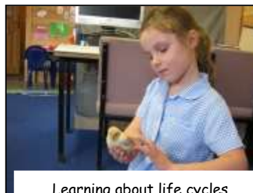
Learning about life cycles through hatching chicks