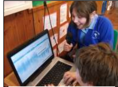
Recording a radio broadcast

Teaching about e safety is inbuilt into the curriculum. Children are always supervised when using the Internet and our provider operates a filtered service. Parents and children are required to sign an acceptable use policy before using the Internet.