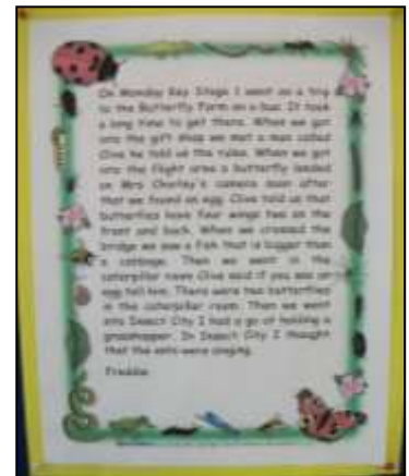
A KS1 recount of a trip to a butterfly farm