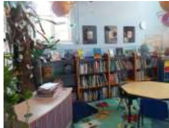
Our school library