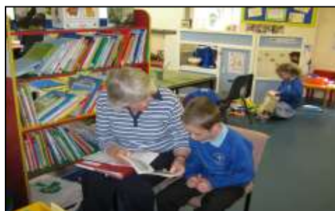
A governor sharing a book

The Governing Body meets as a whole at least once a term. Sub-committees meet at least once a term.