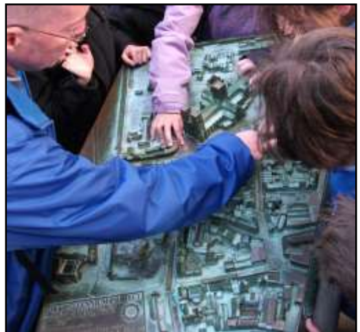
Visiting York to learn about Vikings