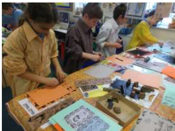
Taking part in a print workshop with a visiting art specialist

Children develop their observations and manipulative skills using a wide variety of materials and media. Various techniques are taught and explored. Work in 2D and 3D is encouraged. They learn to express their ideas in artistic form and appreciate their own work and that of others. They study the work of other artists and craftsmen and discover the use of pattern, shape, line, colour and form in famous works of art. The children also have the opportunity to fire their own pottery in the school kiln.