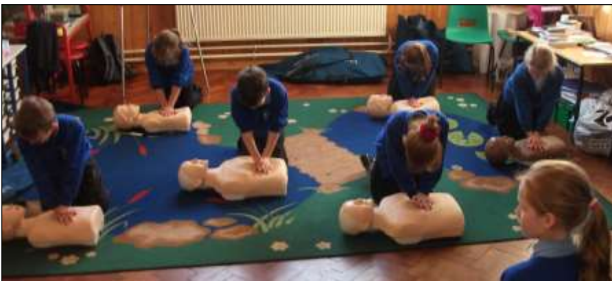
First Aid training in KS2

The school nurse regularly visits to talk to the children about matters of hygiene health and fitness. Children are encouraged to contribute to school matters through the school council. Each class elects representatives who meet on a regular basis.