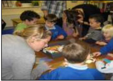
Funtastic Science sessions for parents and children

We welcome a strong link with parents. We know that by working together we can all achieve more for the children. We are always ready to discuss problems or worries, however small. We send regular newsletters to parents to keep them informed of activities, achievements and forthcoming events. We appreciate the skills and talents that parents can bring to our school and welcome their help inside and outside the classroom. If any parents can offer their services to enrich our extra-curricular programme we would be delighted to hear from you!