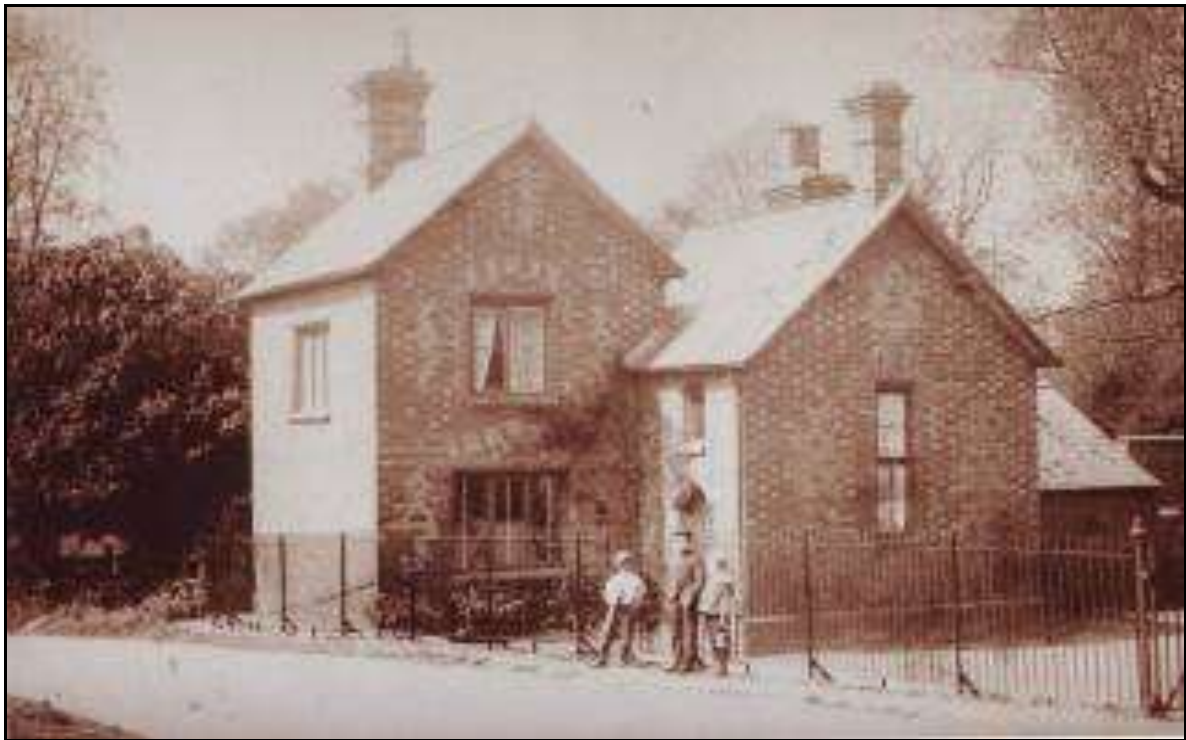
Early 20 th century outside the School House which was then the Headteacher's home.

If you have any complaints or concerns about the school curriculum including Religious Education and Collective Worship please speak firstly to your child's teacher or the Headteacher. The majority of questions and anxieties can be dealt with in this way. However, if you are still unhappy and wish to take the matter further, you have the right to formally contact the Chair of Governors. Please see the schools complaints policy for further details.