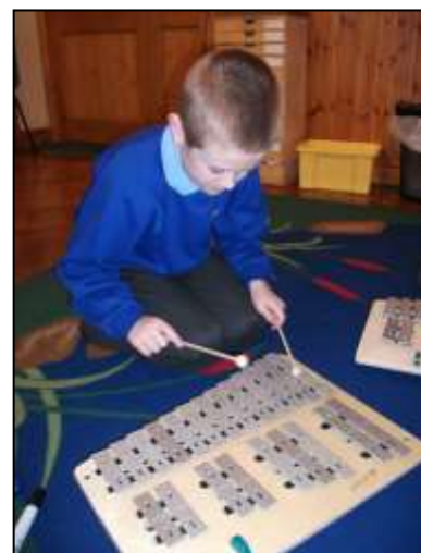
Composing a melody