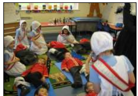
Florence Nightingale Day