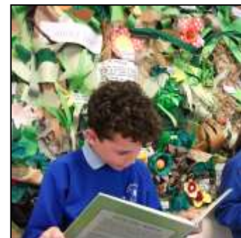
Learning about the Amazon Rainforest