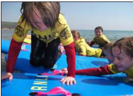
Lifesaving training with the RNLI during a residential visit to Swanage