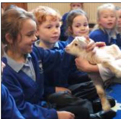
Learning about farm animals

Science is taught throughout the school. It encourages enquiry, observation and exploration. The children learn to plan and set up fair tests, record results, draw conclusions and make hypotheses. Visitors, trips and outside stimuli are used to bring science to life. The programmes of study include an understanding of living things, plants, humans, animals, the properties of materials and physical processes (electricity, forces, the earth in space etc).