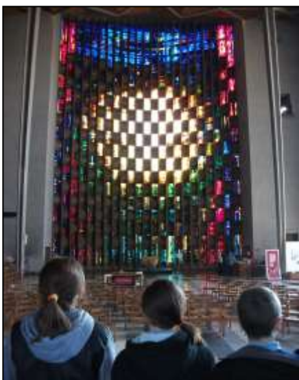
Visiting Coventry Cathedral