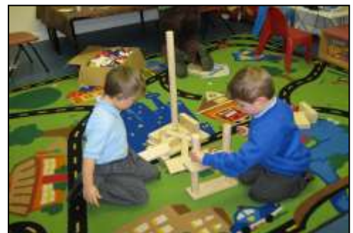
Designing and building