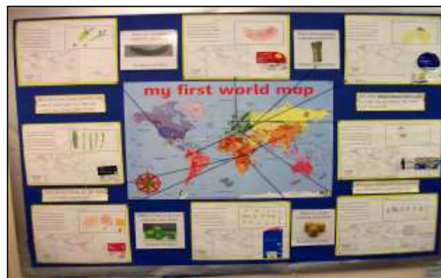
Learning about food miles in KS1