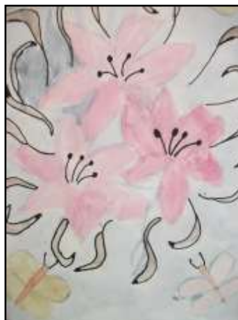
Painting inspired by the Victoria artist William Morris