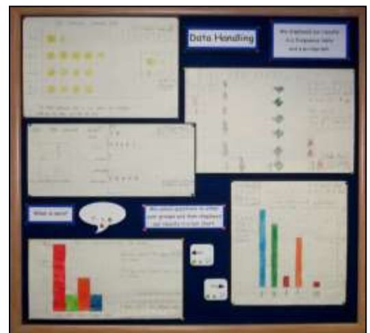
A maths display

A high emphasis is placed on learning tables and using and applying mathematics.