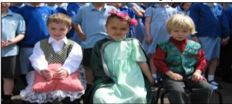
The May Queen and entourage

We have an active and friendly association, FOSKs, which provides support for the school in practical and monetary terms. A small committee, ably supported by other parents and friends, aims to foster close links between home and school and support the education of all pupils. Fund raising plays a large part in all of this. There are regular events which are well attended as well as being a lot of fun. There are strong ties with the village and surroundings. We hold an annual May Fayre with traditional dancing and the crowning of a May Queen at the school. If you would like to attend the meetings you will be most welcome.